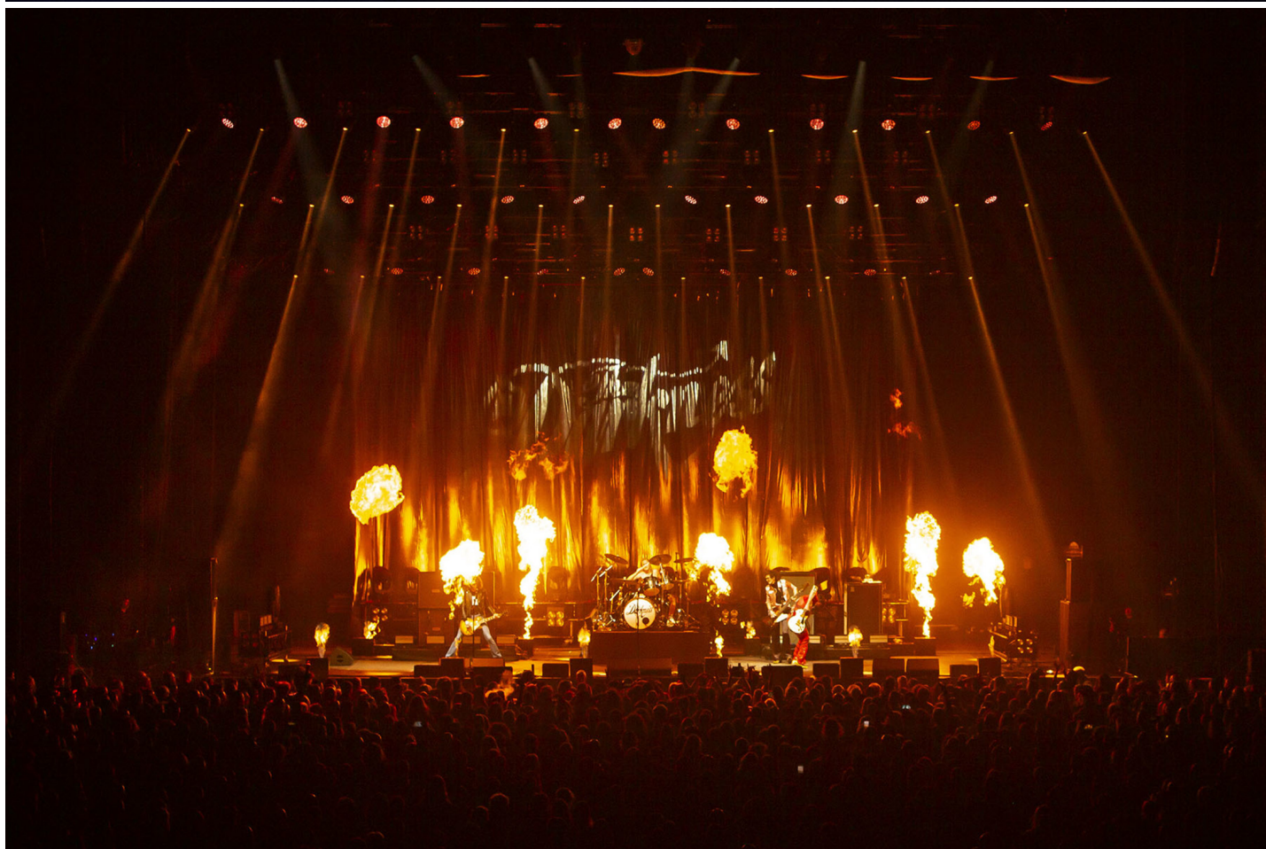
The Darkness and Black Stone Cherry co-headliner Blasts Around the UK with Robe