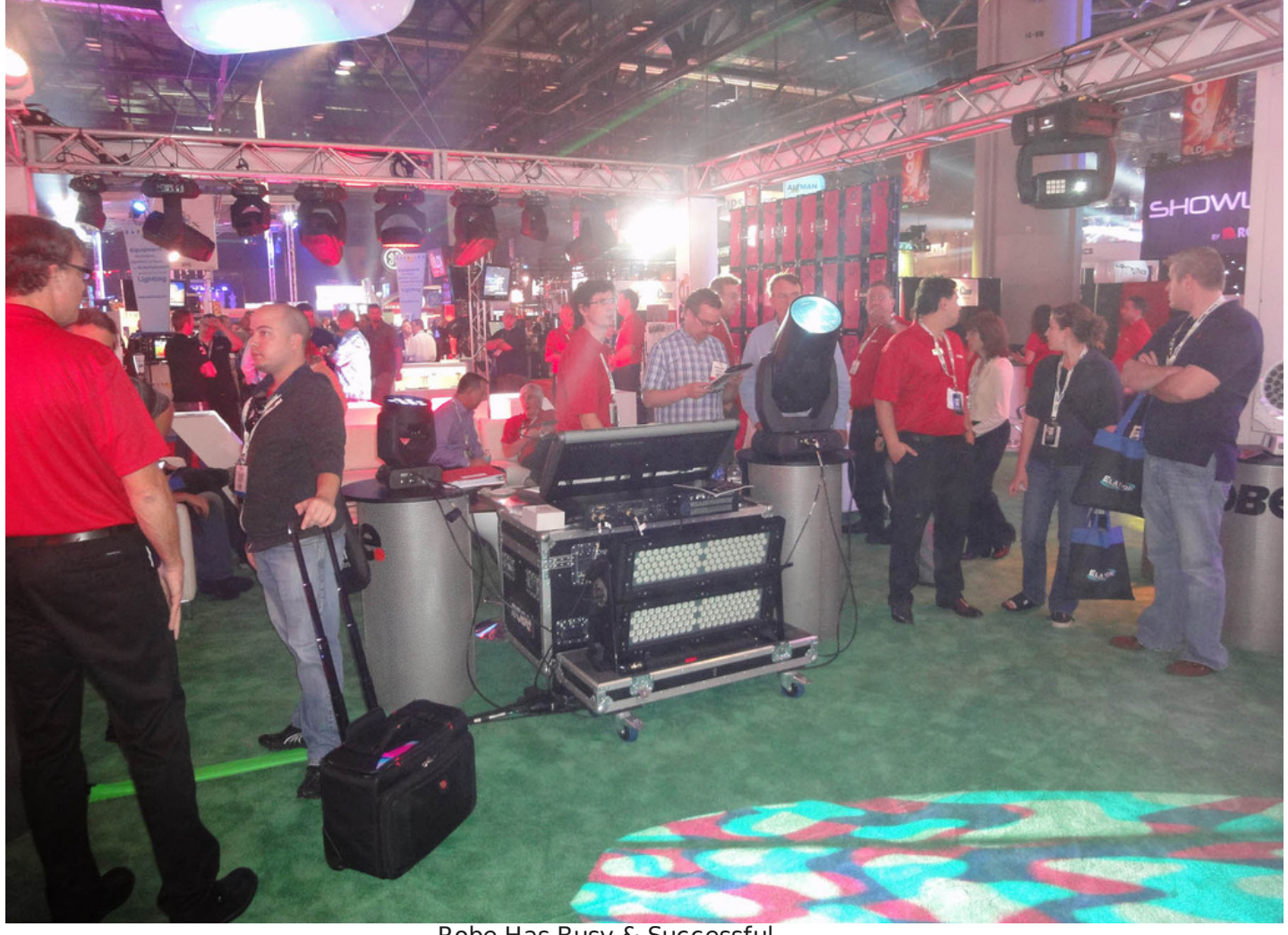
Robe Has Busy & Successful