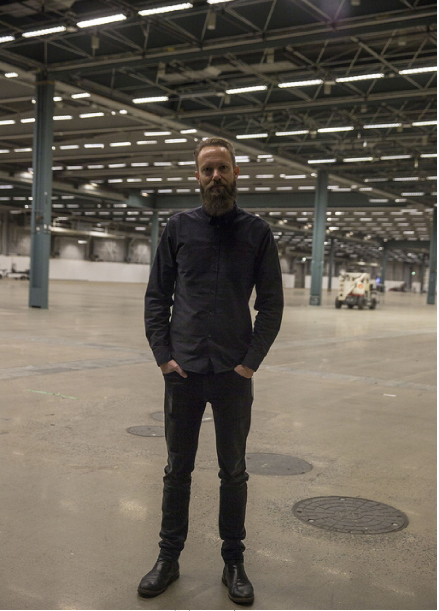
Stockholm International Congress Centre Chooses Robe