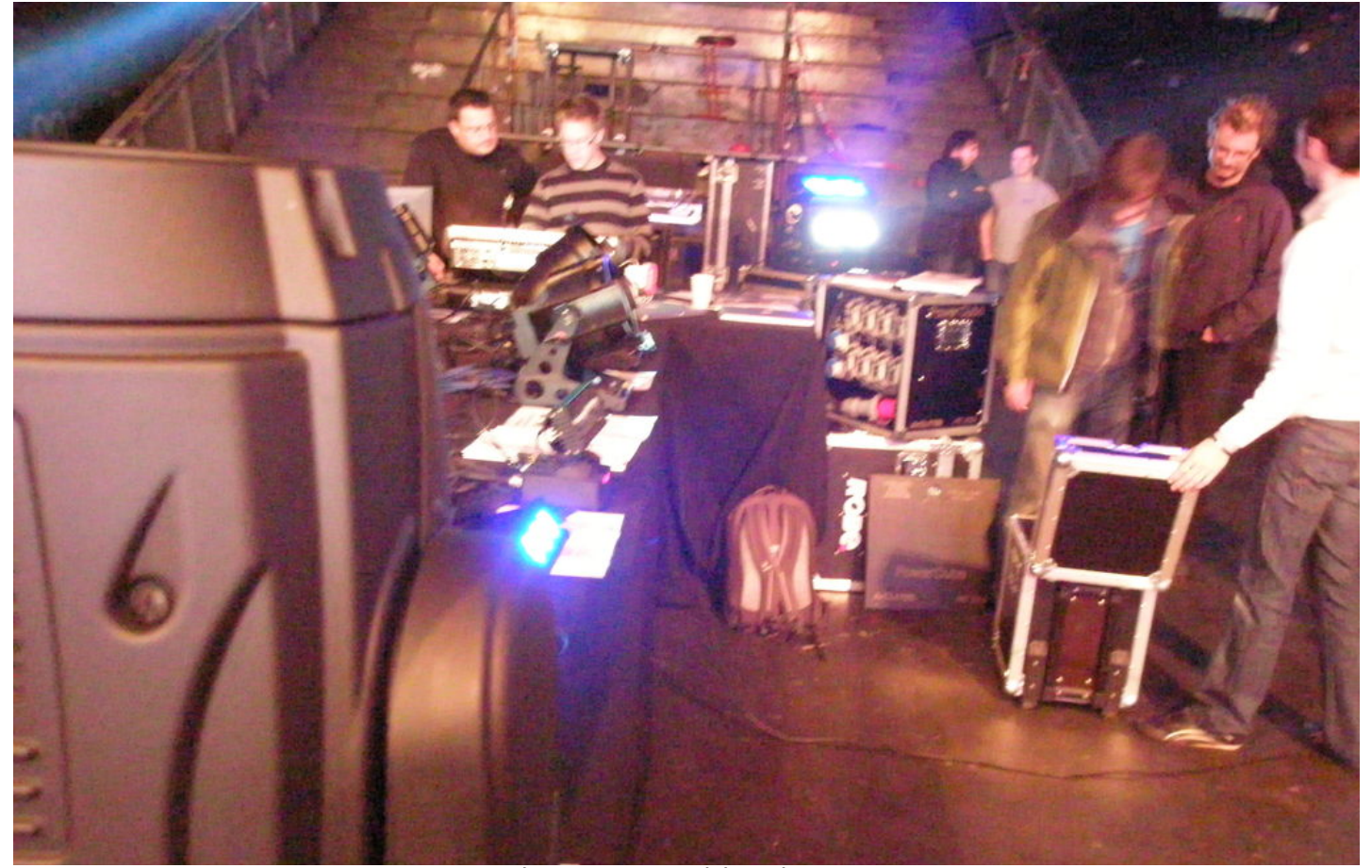
Robe ROBIN Roadshow in Austria